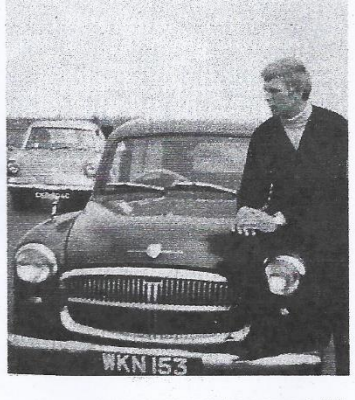
MAY 2024 I CLASSICS WORLD | 21